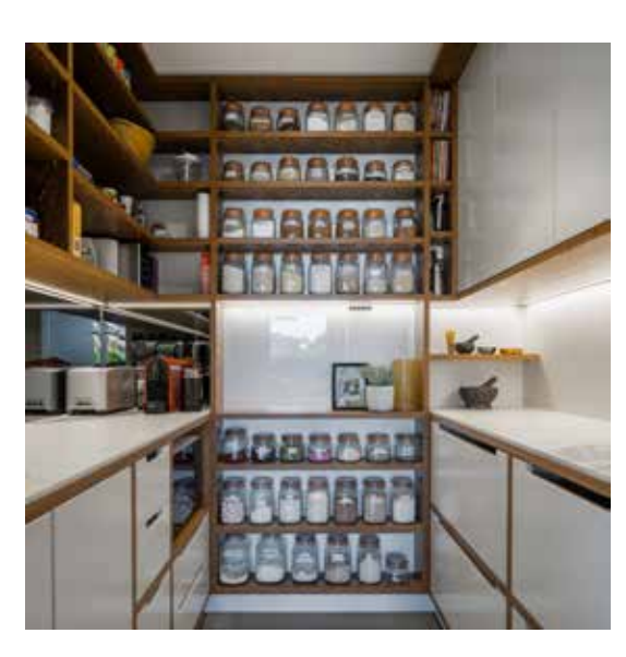
This kitchen by Daniel Lomma Design includes a well-stocked pantry. Together with fitted cabinetry and plenty of display shelving, there's also a microwave and other small appliances.