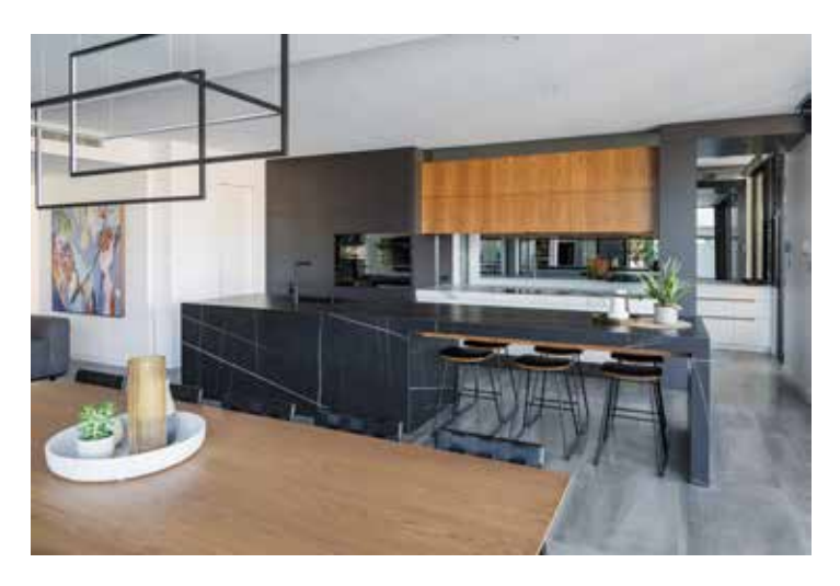
The rear scullery splashback doubles this kitchen's sense of space. A second splashback, to the rear of the main kitchen, retracts behind the full height dark-toned cabinetry to the left.