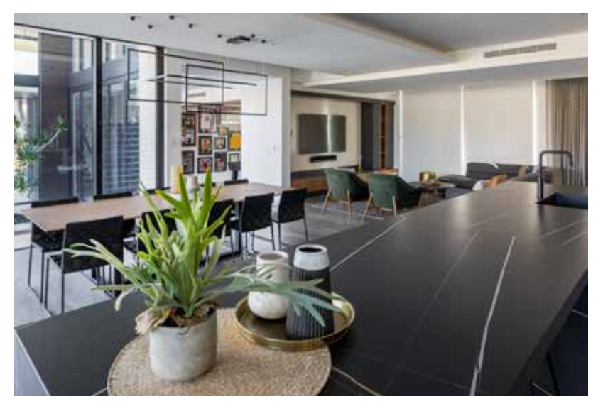
The chef in this family and entertainer's kitchen can prepare dinner and chat with guests or family members at the same time.