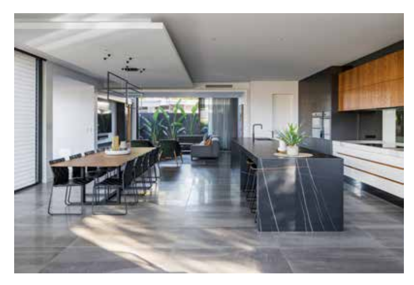
The casual island stools in this kitchen can be tucked right in under the benchtop for a sleeker look.