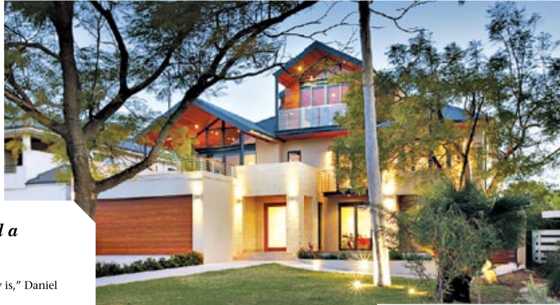
The renovated Applecross residence with the new second and third storeys blending with the surrounding trees.