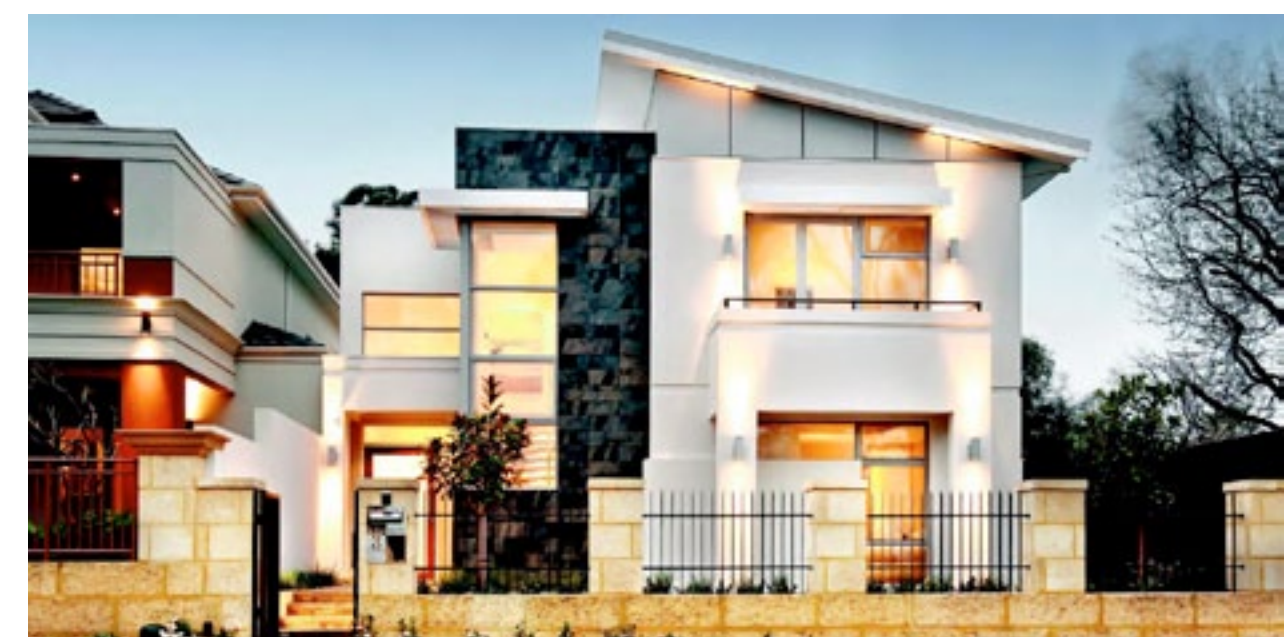
The Santorini evokes images of whitewashed walls, azure seas, brilliant clear light and easy, relaxed living.