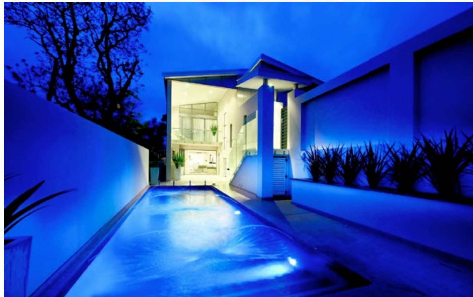
The pool, with its criss-crossing fountain sprays, has rich blue LED lights.