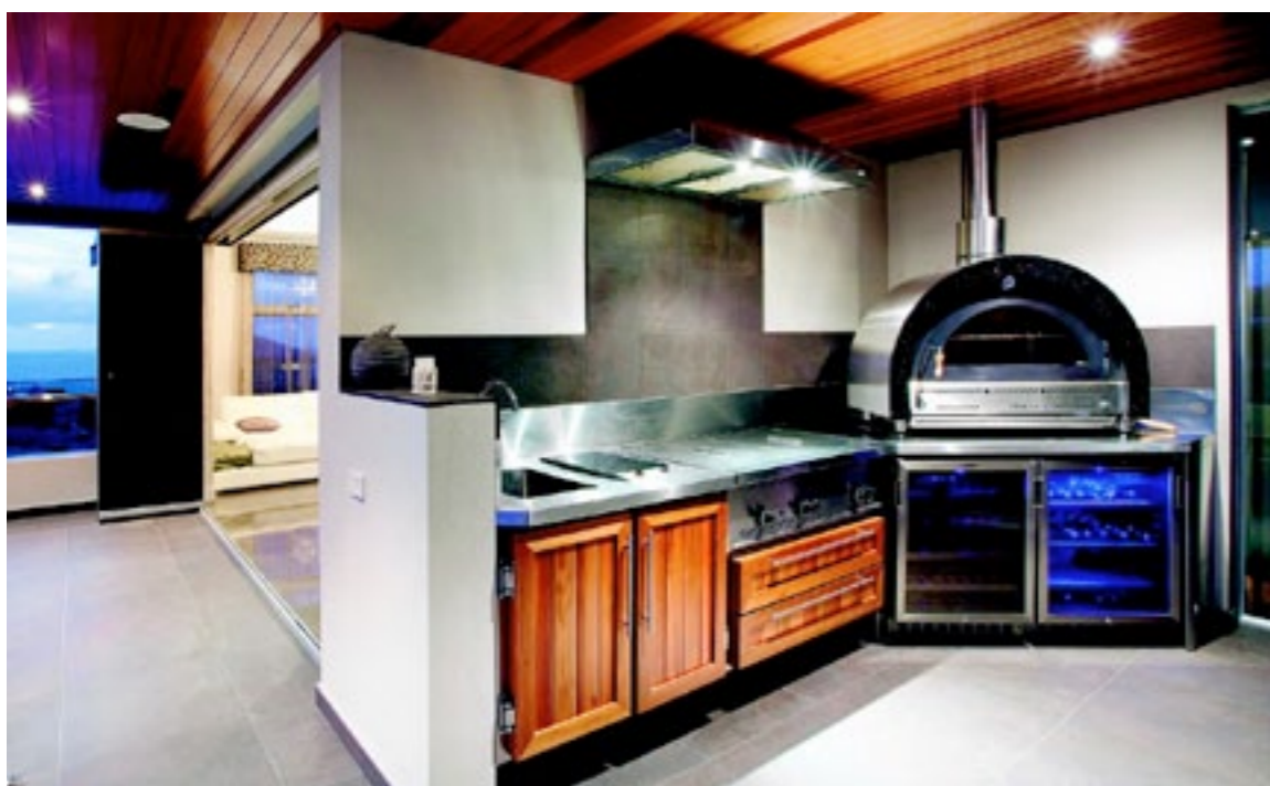
The owners have thought of everything, including a pizza oven.